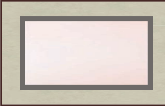
Classic Frame with Palette White Diffuser