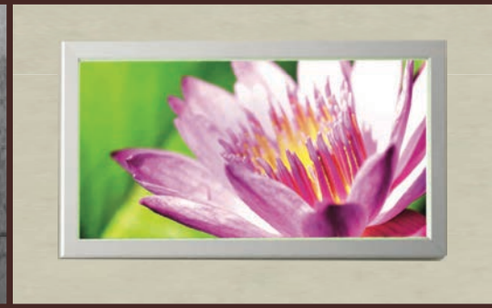
Snap Frame with Custom Image on Film