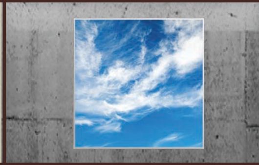
Classic Frame with Sky Image on Acrylic